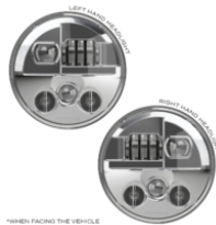
Part Number 0557493 LED Headlight - Model 8730 Shallow 7" Round, Chrome (Pair)