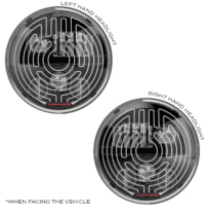
Part Number 0555883 LED Headlight - Heated Model 8730 Shallow 7" Round, Black (Pair)