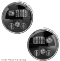
Part Number 0557423 LED Headlight - Model 8730 Shallow 7" Round, Black (Pair)